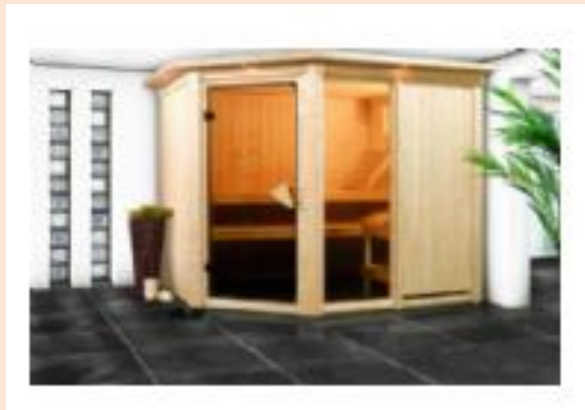
Karibu Sauna Fiona 1