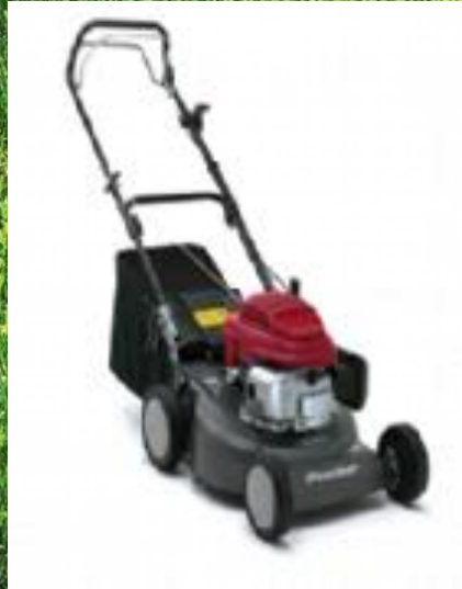
HONDA JRG 465 CSX

4,5 PS OHC Honda 4-stroke engine 46 cm cutting width Sheet steel housing 5-fold height adjustment Grass bag