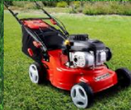
FLYMO L 400