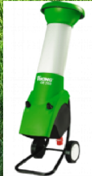
VIKING Shredder GE 345