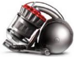
DC33c Origin Plus