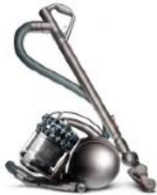
DC52 Animal Turbine