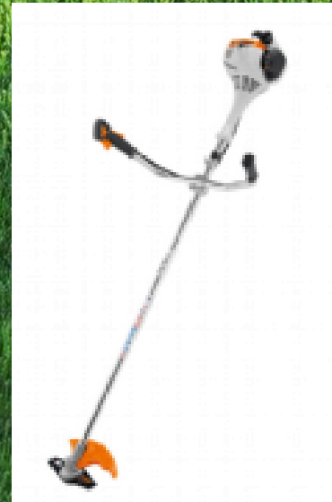
STIHL Motorsense FS 55