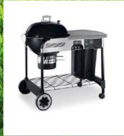
Modern kettle grill "Space"

Art-Nr: 2G26 excl. VAT excl. shipping costs € 285,90 (incl. Grill grate 52 cm diameter, height adjustable, electric, very stable Weight:12.5 kg