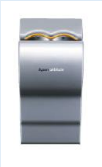
Dyson Airblade Aluminium