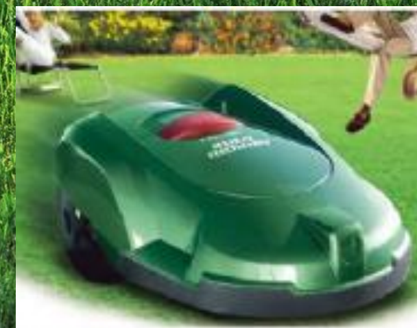
HUSQVARNA Auto Mower