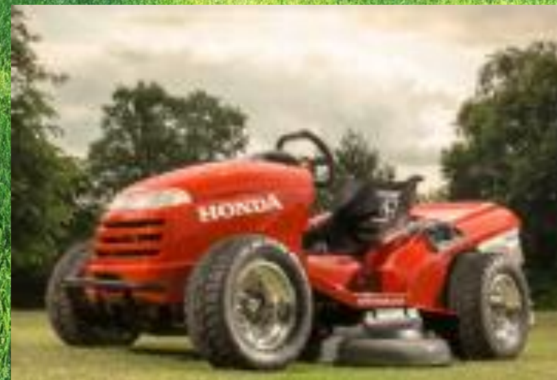
HONDA Riding Mower HF 122 S

11 HP OHV HONDA 4-stroke engine, 71 cm cutting width, 5 forward and 1 reverse gear, 7-way height adjustment, rear discharge and 170 litre grass container Weight: 240 kg